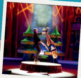
CIRQUE DREAMS HOLIDAZE

PERFORMING ARTS CENTER THE UNIVERSITY OF TEXAS OF THE PERMIAN BASIN